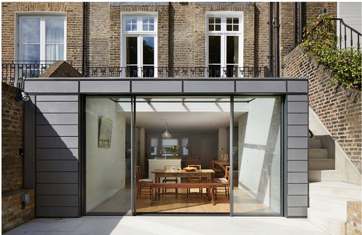
New extension view from the garden