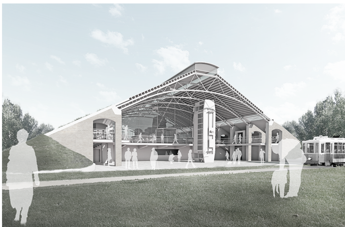
The Black Country Living Museum visitor's centre in Dudley, Birmingham, UK