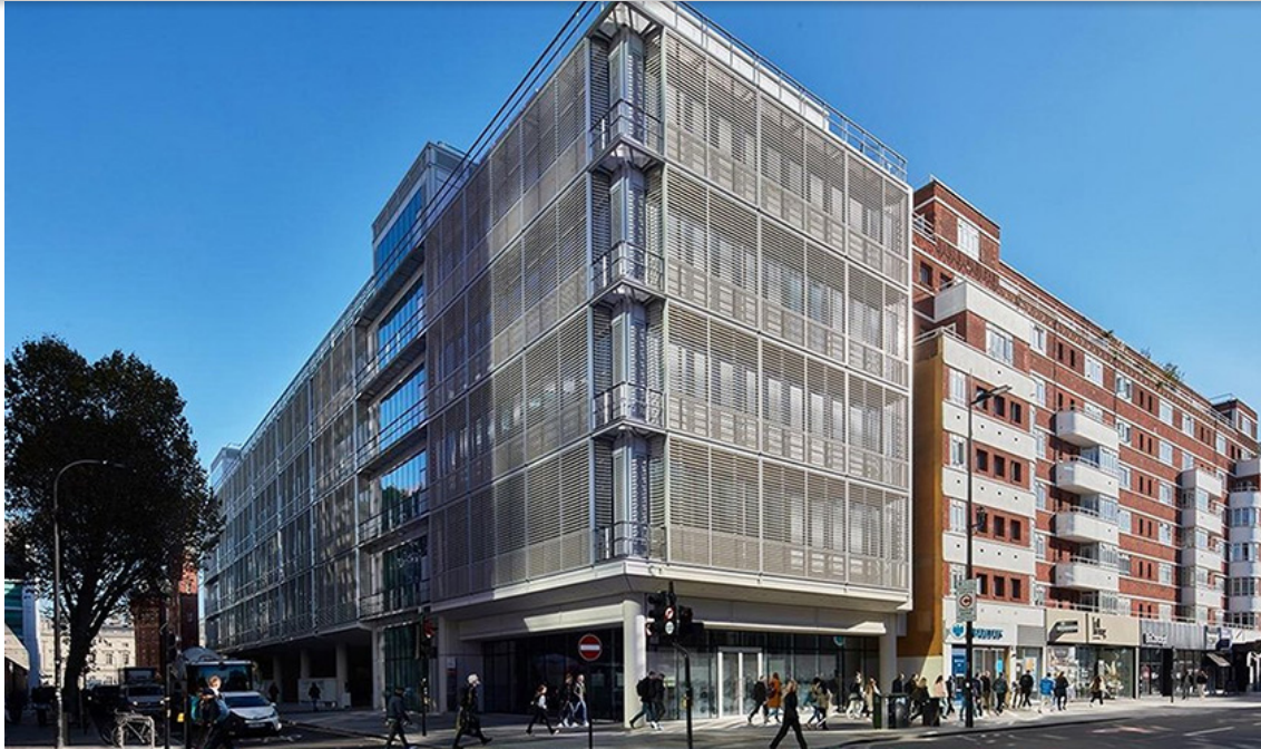
The Grafton Way building, London, UK