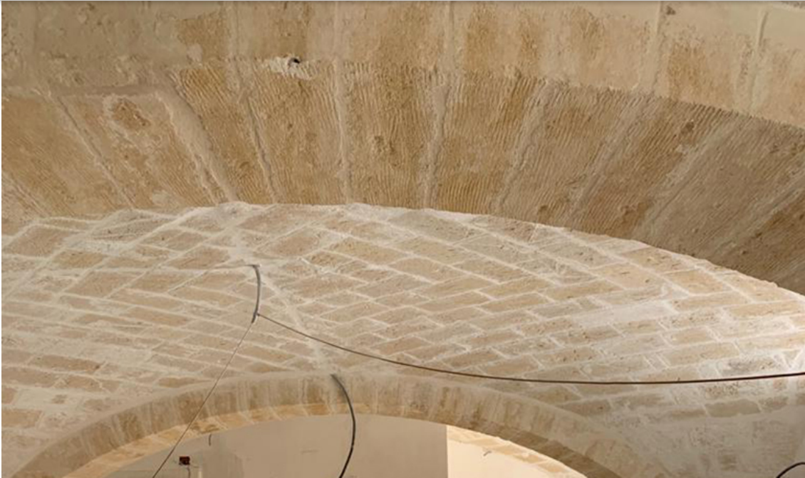
Construction photograph of the vaults, arches just unveiled

An important objective of the project to refurbish the beautiful palazzo in Puglia in the heel of Italy, is to enhance the character of the internal spaces so they function for modern life, and at the same time resolve multiple material and building fabric issues common to historic buildings. We therefore decided to uncover the arches and the vault ceiling to expose the original “tufo” stone texture by chiselling away the plaster finish. Due to the delicate nature of the work, the plaster finishes are removed by hand, unveiling little by little the beautiful stone textures of this stunning historical building.