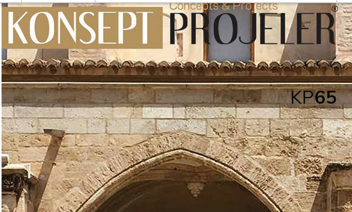
Cover of the Konsept Projeler issue 65

Covid was a crisis for humanity, and perhaps also an opportunity to learn from its mistakes, or was it “the last exit before the bridge”. The Turkish magazine, KP65, has published a special issue entitled Feed Forward Post Pandemic that focusses on the many temporary and permanent traces that Covid has left on our lives, and looks through the eyes of architects and designers at possible changes in the near and distant future as a result of the pandemic.