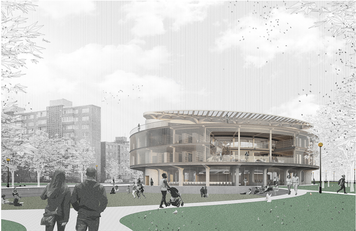
Library rendered view