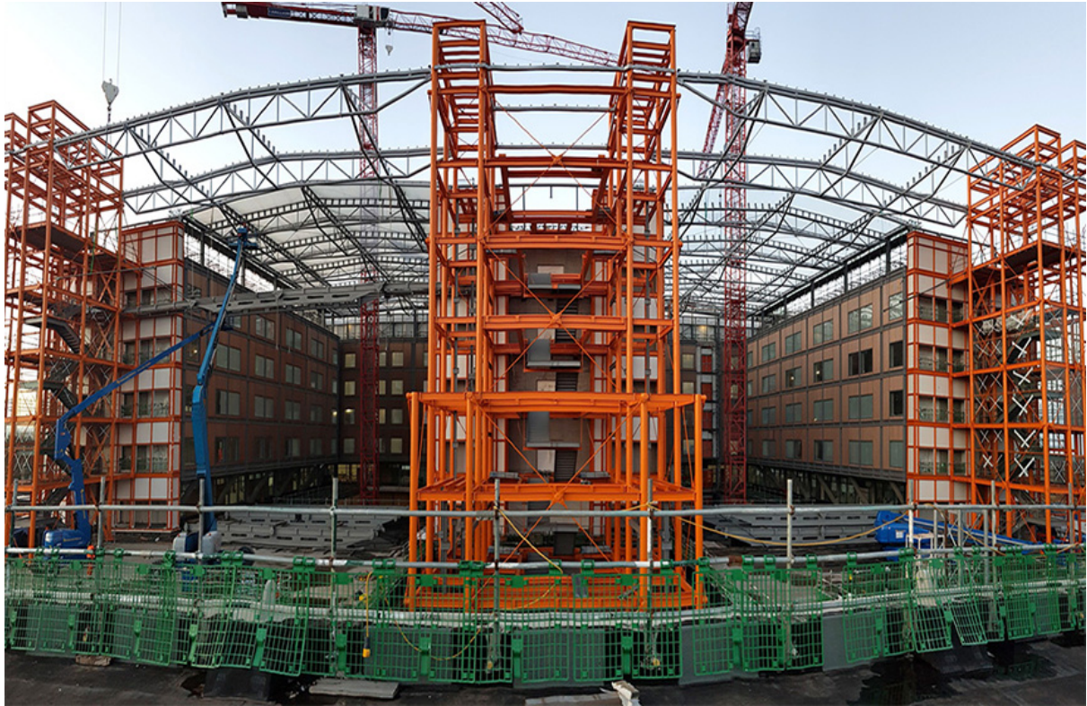
View of the winter garden with bridge structure being elevated in place