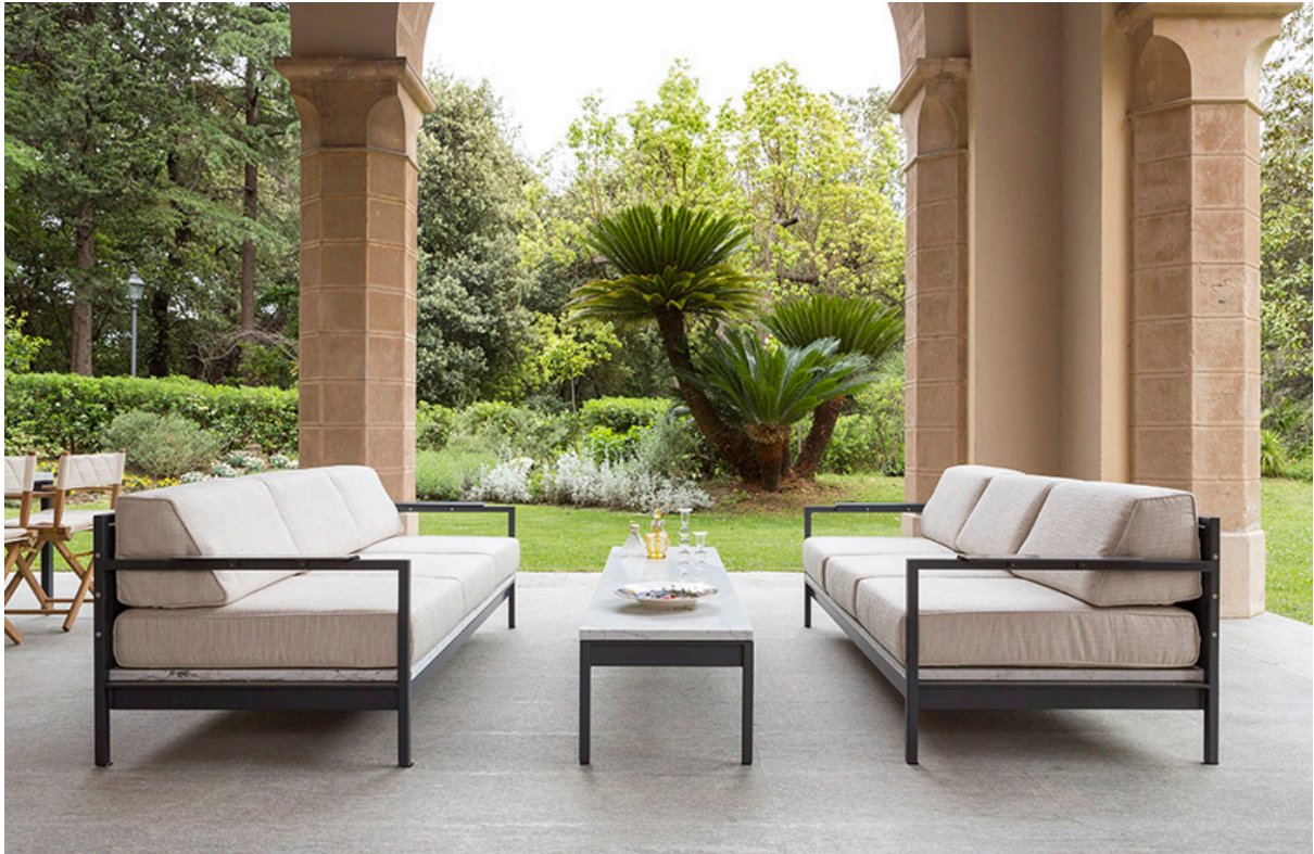
View of the bespoke outdoor "Loggia" sofas